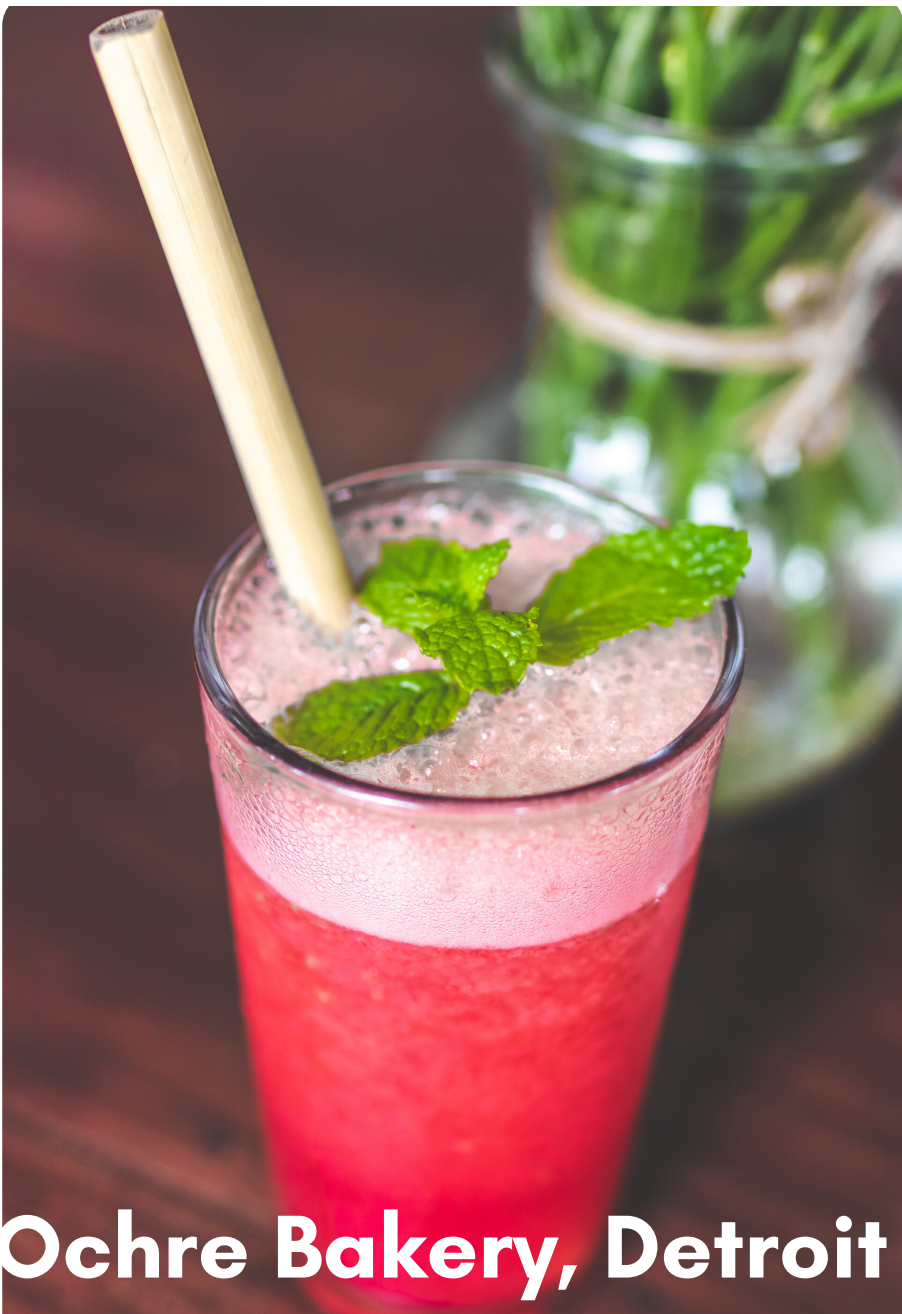
Ochre Bakery, Detroit