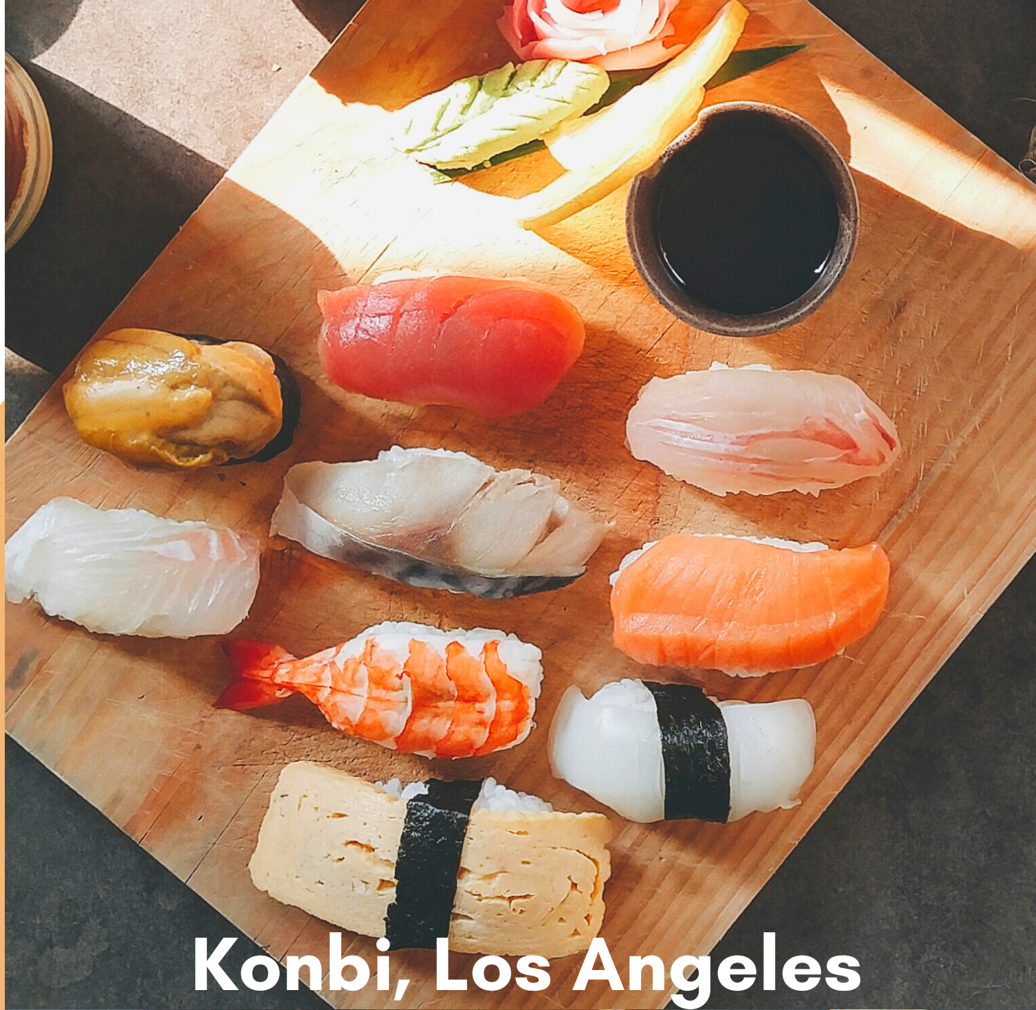
Konbi, Los Angeles