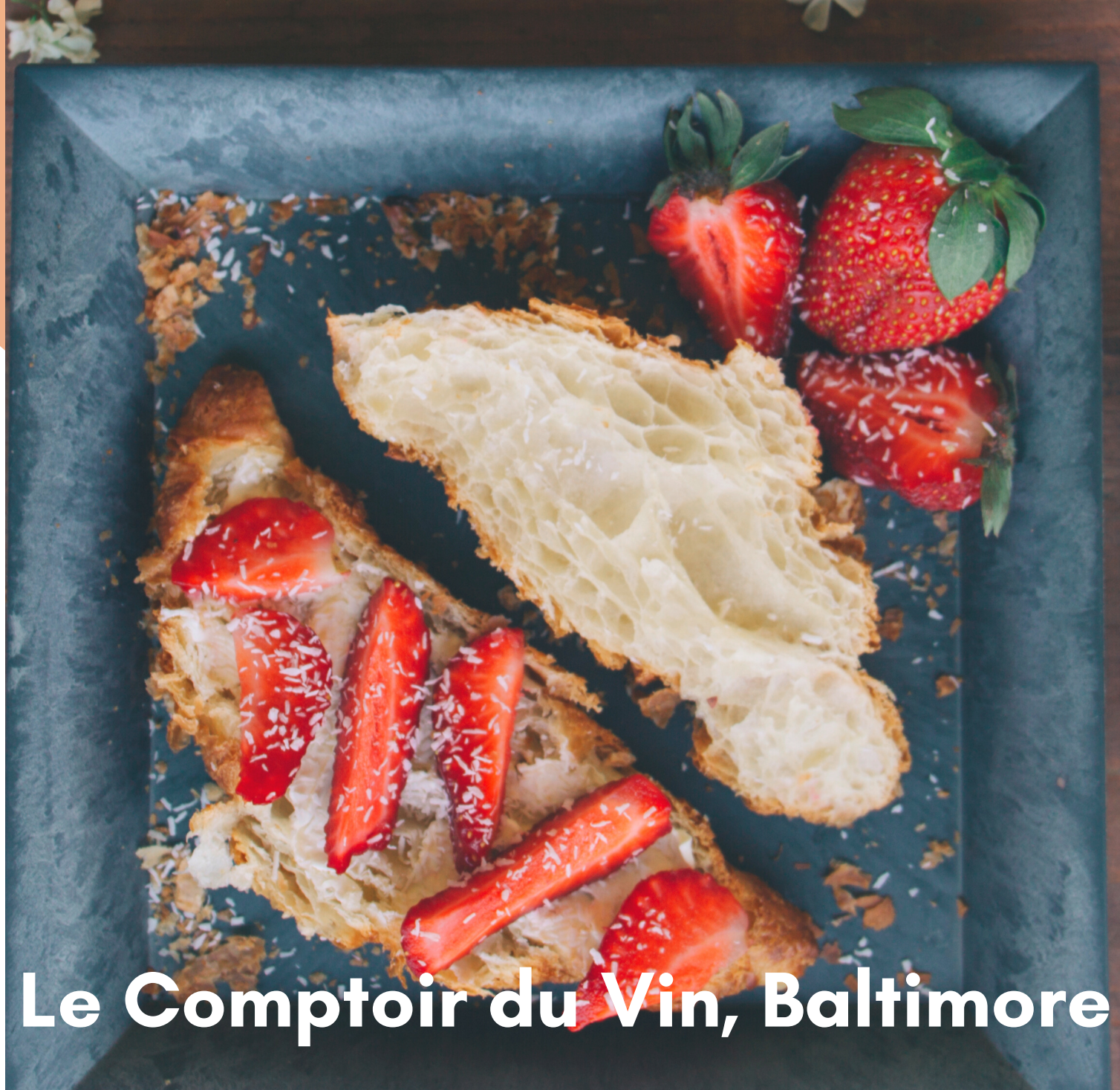
Le Comptoir du Vin, Baltimore