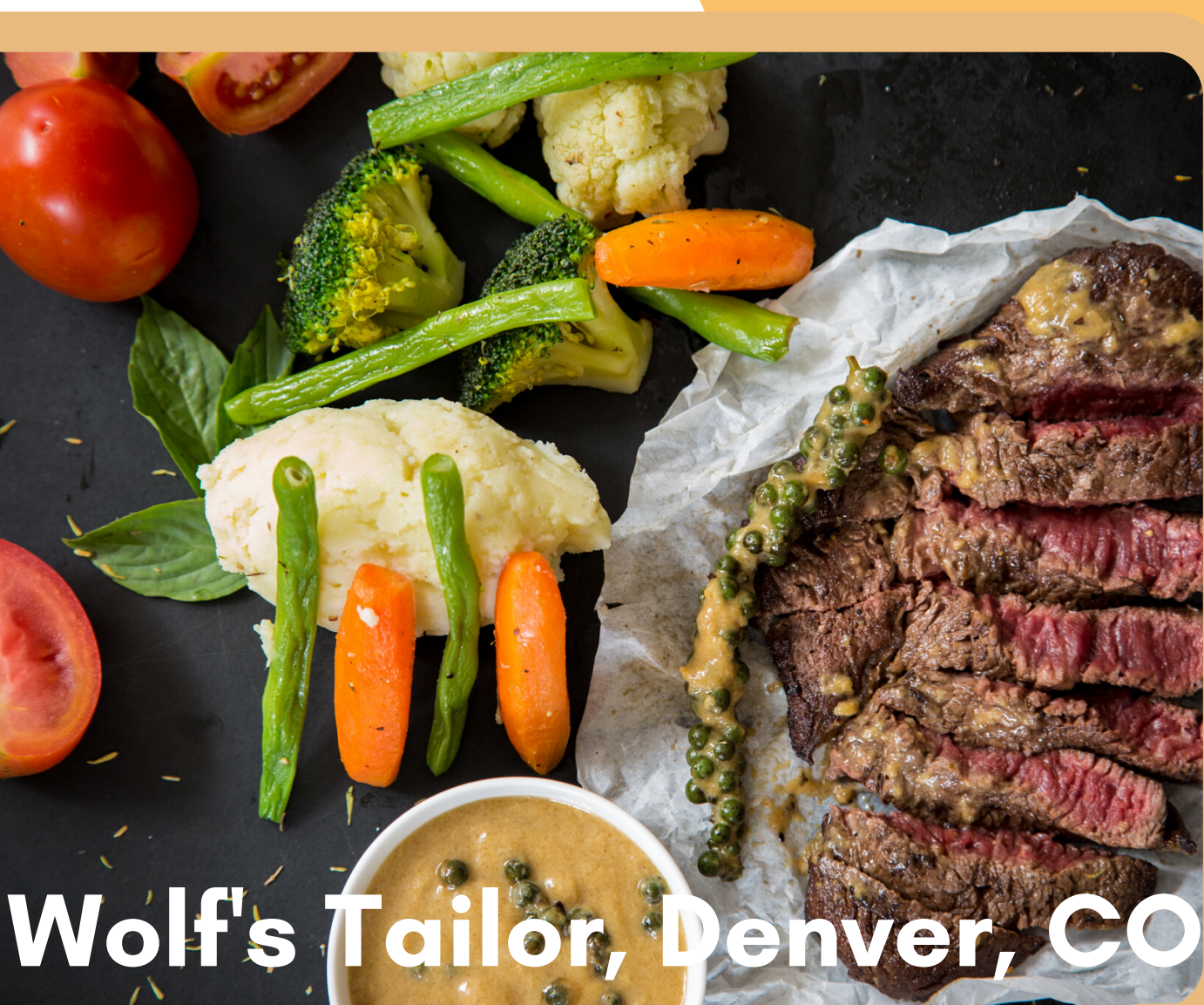
Wolf's Tailor, Denver, CO

Tune into our Facebook Live where the nominated restaurants will cook their own recipes to make at home