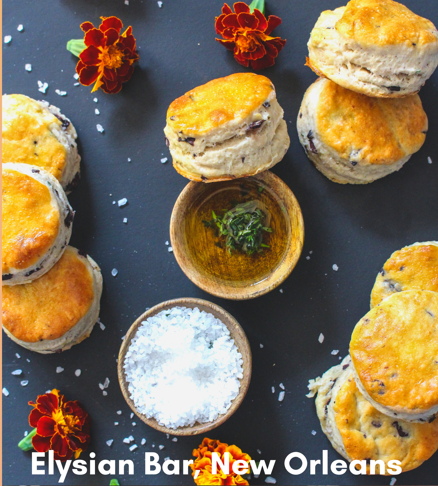
Elysian Bar, New Orleans